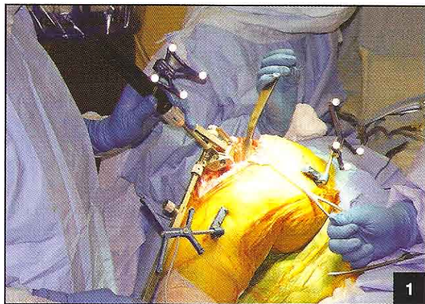
Figure 1. Medial percutaneous placement of trackers in the sagittal plane of lower extremity with active LED tracker on the tibia and passive tracker on the femur.

Kinematic referencing in TKA was a novel innovation to determine the center of the hip and ankle, markedly simplifying this procedure. 33 As the hip is not directly visible, a method was needed to accurately reference the hip center. This was accomplished by tracking the femur with the optical camera as the femur was rotated in a circular motion. The movement of the tracker described the base of a cone, which when projected to its zenith, closely approximates the center of the hip. The computer algorithm calculates either the root-mean-square error or the standard deviation, which must fall within a limited range for the computer to accept the hip center reference point.