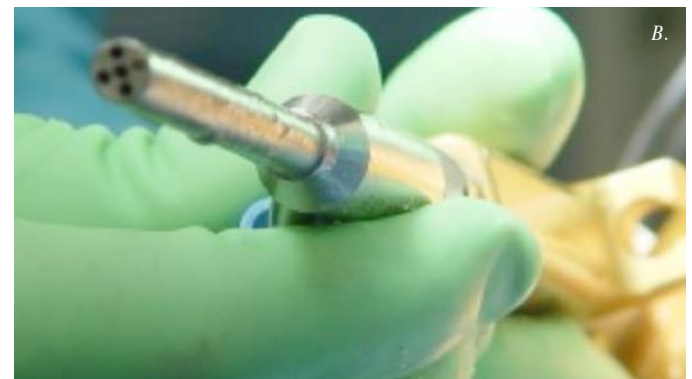
Figure 2. (A) Clogged suction tip; blockage at screen prevents continuous flow of suction. (B) Same suction tip immediately after screen has been cleared by a rapid blast of pressurized medical-grade carbon dioxide gas.